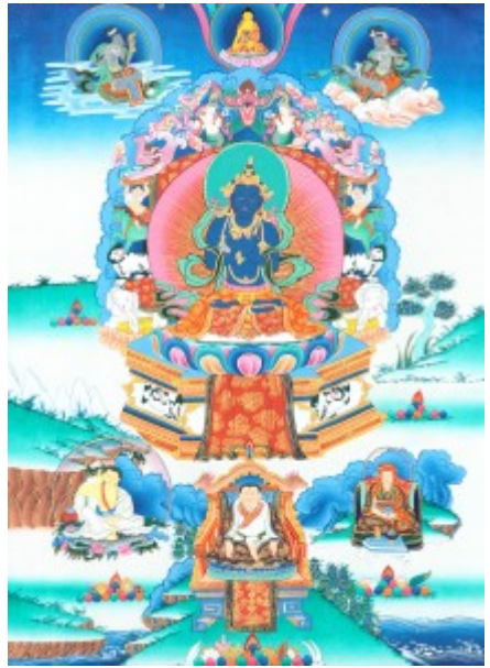
Phật Kim Cang Trì